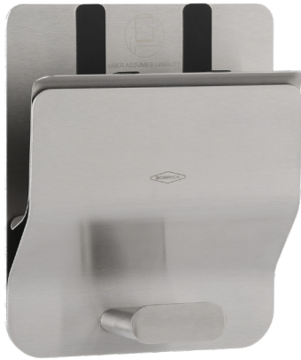
Patented, Patent Pending