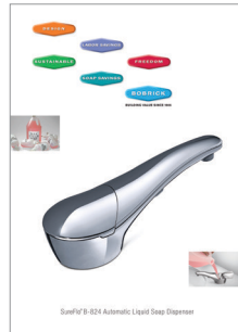
SureFlo® B-824 Automatic Liquid Soap Dispenser