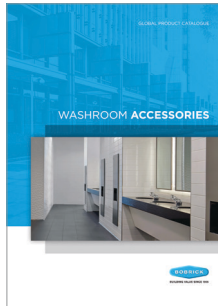
Washroom Accessories Catalog

Bobrick is proud to offer industry-leading products and design expertise. For indispensable design, compliance and logistics support, contact your Bobrick representative or visit bobrick.com .