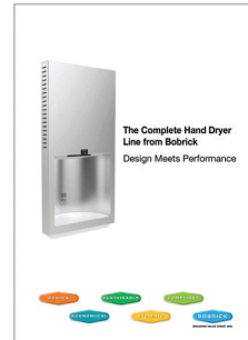
The Complete Hand Dryer Line from Bobrick