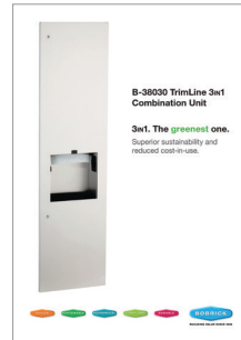
B-38030 TrimLine 3in1 Combination Unit